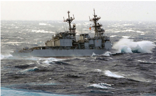
USS Paul F Foster Heading into Heavy Seas