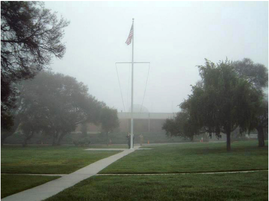
FNMOC Flagpole with Computer Center in Background